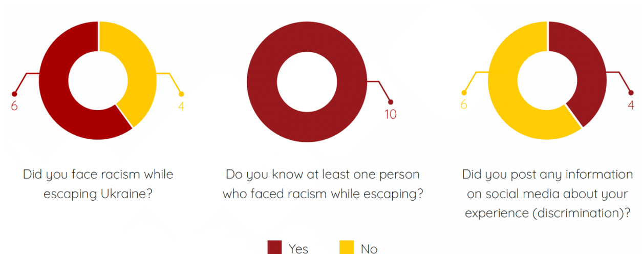
Responses from 10 Nigerian Students Who Escaped the War in Ukraine